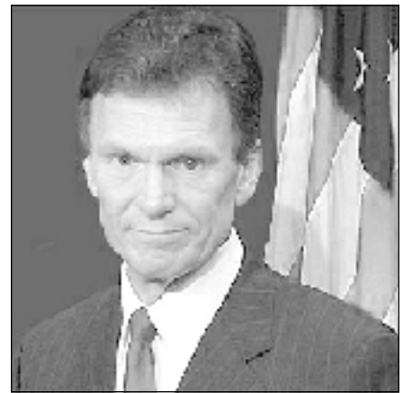
Sen. Majority Leader Tom Daschle (D-SD) was asked by President Bush and vice-President Cheney to limit scope of 9/11 investigation

A May, 2006 Zogby Poll revealed that more than 42 percent of Americans believe that "the U.S. government and its 9/11 Commission concealed or refused to investigate critical evidence that contradicts their official explanation September